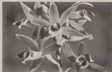
NUN'S LILY ORCHID

Botanically known as Phaius grandifolius, this terrestrial or earth-growing orchid is fast becoming a favorite for planter boxes, tubs, patio beds and landscape plantings in gardens. The flowers are borne on tall spikes with twelve to twenty flowers to each stalk, and each flower is three to four inches wide, silvery white outside and yellowish-brown with a purple lip margined with the yellowish brown. Within the lip is an ivory-like replica of a hooded nun, thus giving the plant the common name of Nun's Lily Orchid. Easy to grow.